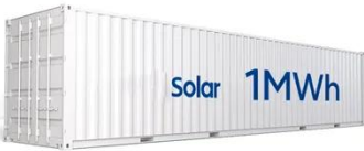
Standard 40ft containers