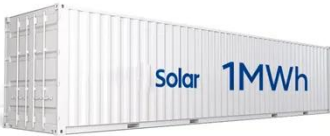
Standard 40ft containers