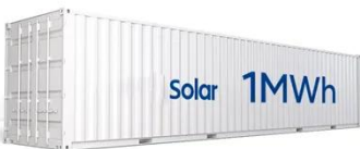
Standard 40ft containers