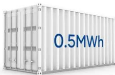
Standard 20ft containers